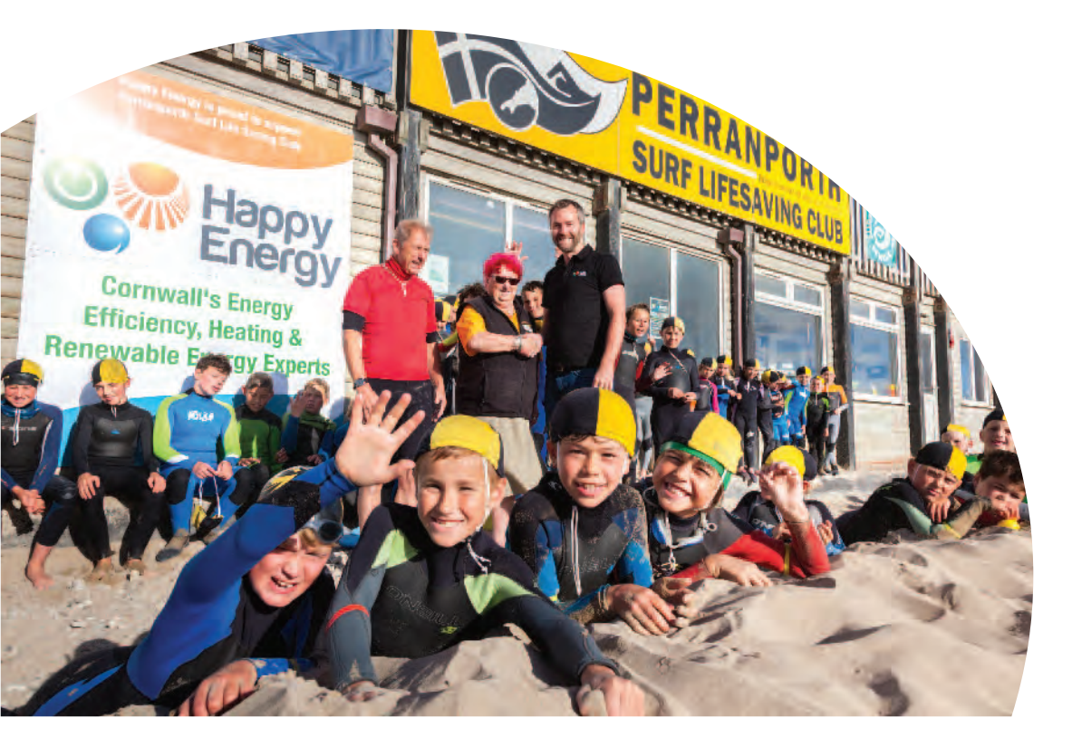
Happy Energy is proud to sponsor Perranporth and St Agnes Surf Life Saving Clubs

Cornwall based, but with national reach, Happy Energy can offer a wide range of options to reduce your energy bills and make your home warmer and more comfortable. We can also offer a range of finance options to spread the cost of the works and help you access a range of grants and other Government financial incentives.